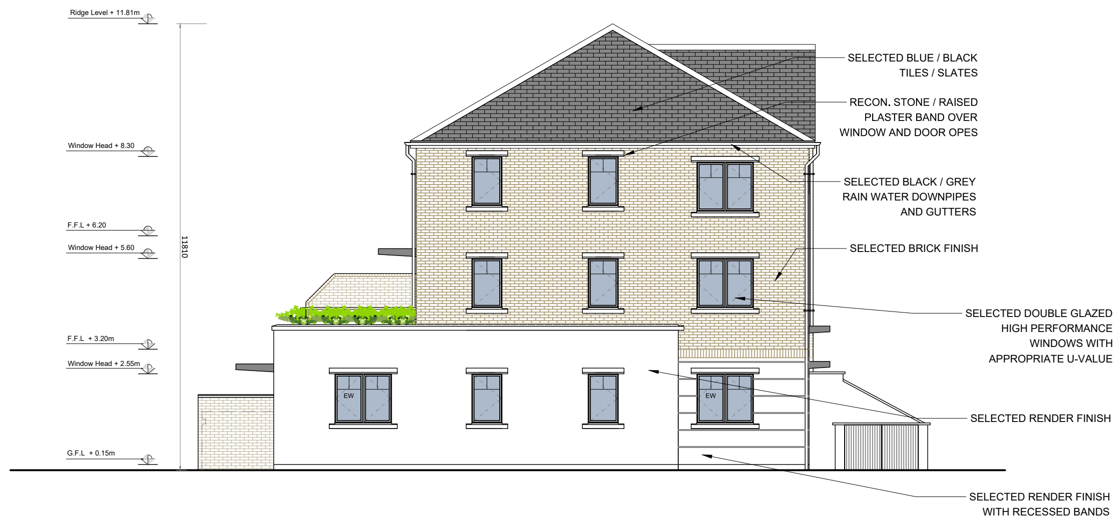
SIDE ELEVATION - BLOCK A, E, H (HANDED), I & K (HANDED)