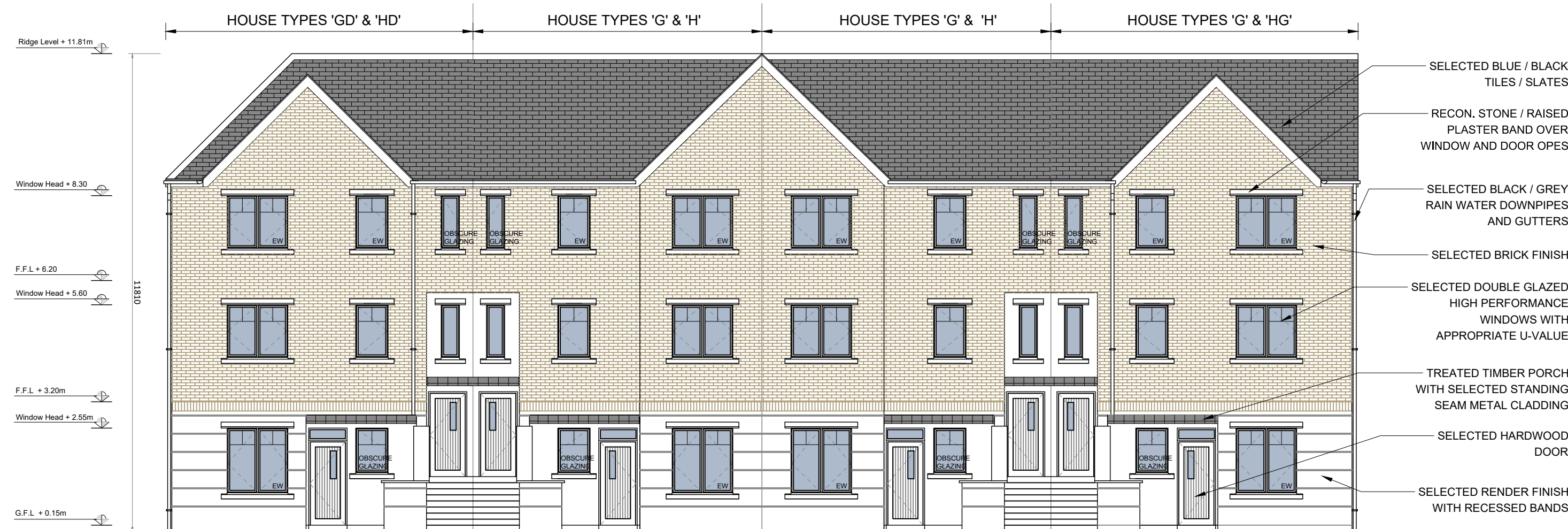
FRONT ELEVATION - BLOCK A, E, H (HANDED), I & K (HANDED)